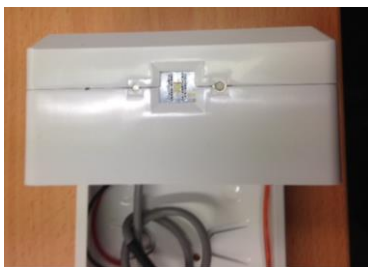
LED POD location on batten