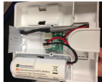
LED Head and Batteries