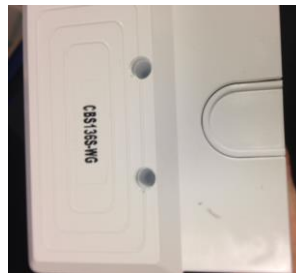
LED POD assembly screws